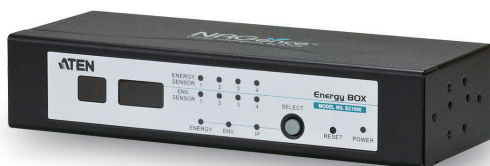
● EC1000 front view