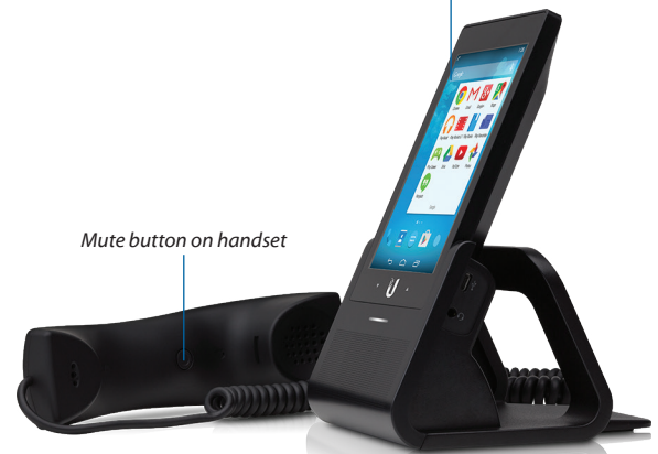
Mute button on handset