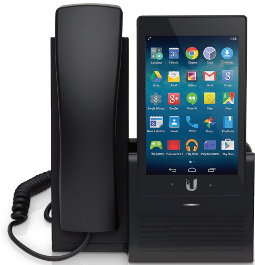
Multi-Touch Color Display

* Touchscreen measurements are diagonal.