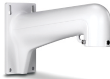
Wall Mount TV-HW400