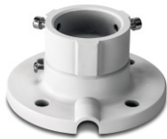
Ceiling Mount TV-HC400