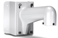
Corner Mount TV-HN400