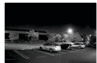
30 M Night Vision