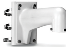
Pole Mount TV-HP400