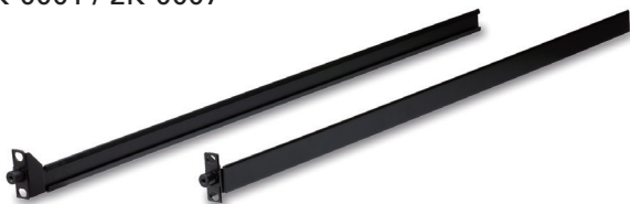
Easy Installation 2K-0002