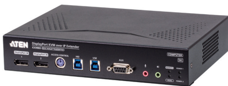
KX9980T Rear View