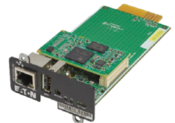
Eaton Network-M2 (angled)

Eaton's full range of network connectivity devices enables you to remotely monitor and manage your power quality equipment. From outlet by outlet energy consumption reports to temperature and humidity readings, connectivity devices give you full control of your IT environment from offsite. This high level of awareness and control allows you to take full advantage of helping ensure business continuity.