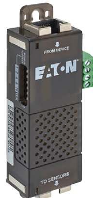
Eaton EMP Gen 2