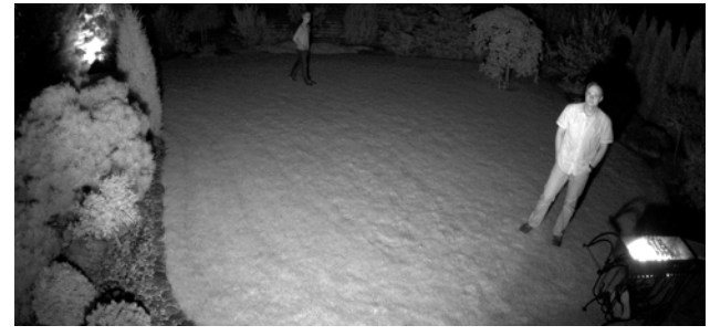
B/W sensor with IR illuminator