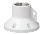
WV-QCL100-W Mount Bracket