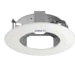
WV-QEM100-W Mount Bracket