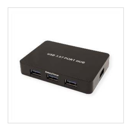
USB 3.0 / USB 3.2 Gen 1 Hub with seven ports for peripheral devices like mouse, keyboard or printer and data carriers like SSDs and USB sticks - with a data transfer rate of up to 5Gbit/s!

7-Port USB 3.0 / USB 3.2 Gen 1 Hub for connecting storage devices such as SSDs and USB sticks or peripheral devices such as mouse, keyboard and printer.